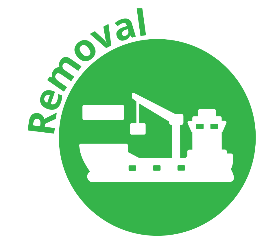
The lightweight aggregate product will be removed by ship