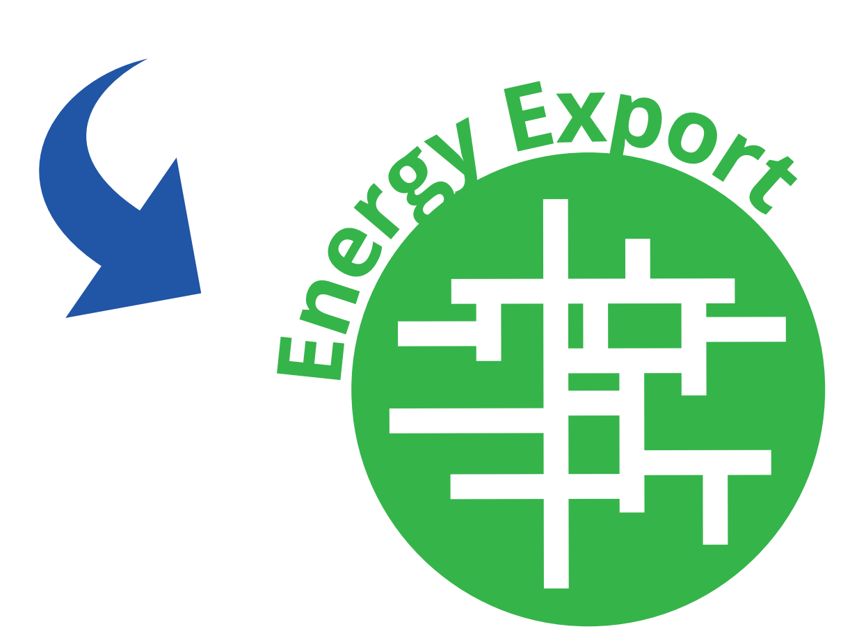
Around 80MW of power is exported to the National Grid via a grid connection and substation