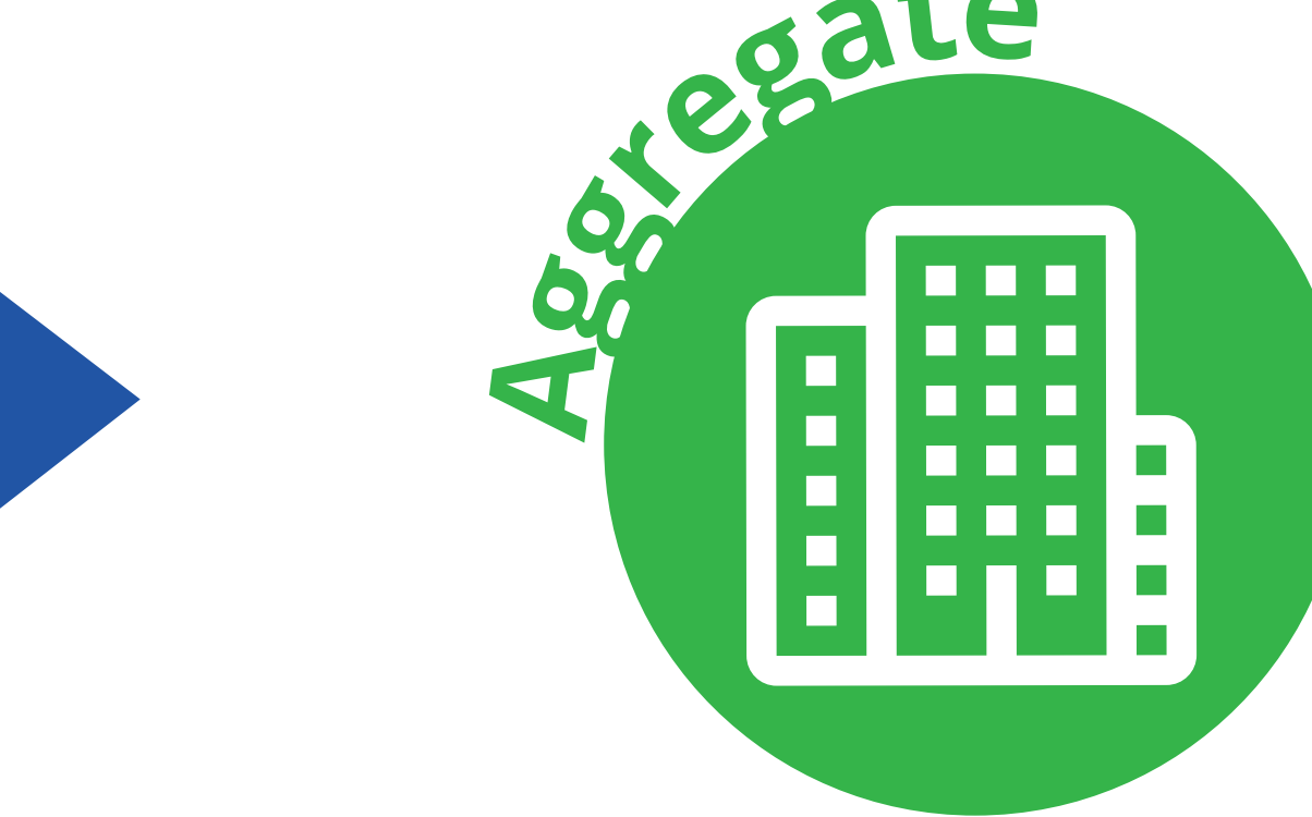
Bottom ash and air pollution control residues from the thermal treatment will be transferred to the lightweight aggregates plant, where it is recycled on site to produce aggregates for use in the construction industry