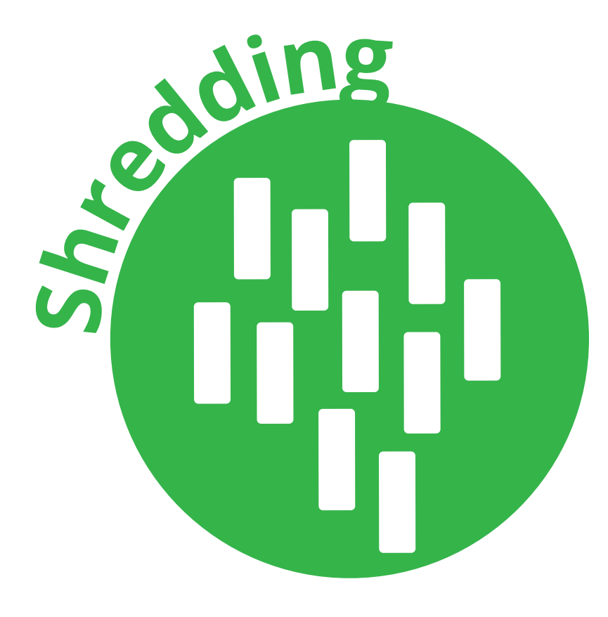
Bales split open by shredding in a sealed building