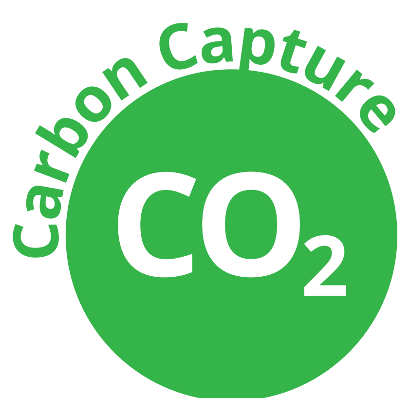
Two Carbon dioxide (CO<sub>2</sub>) recovery plants will recover some of the CO<sub>2</sub> to be reused off-site in a range of industries. Some will be retained on-site for use in fire prevention.